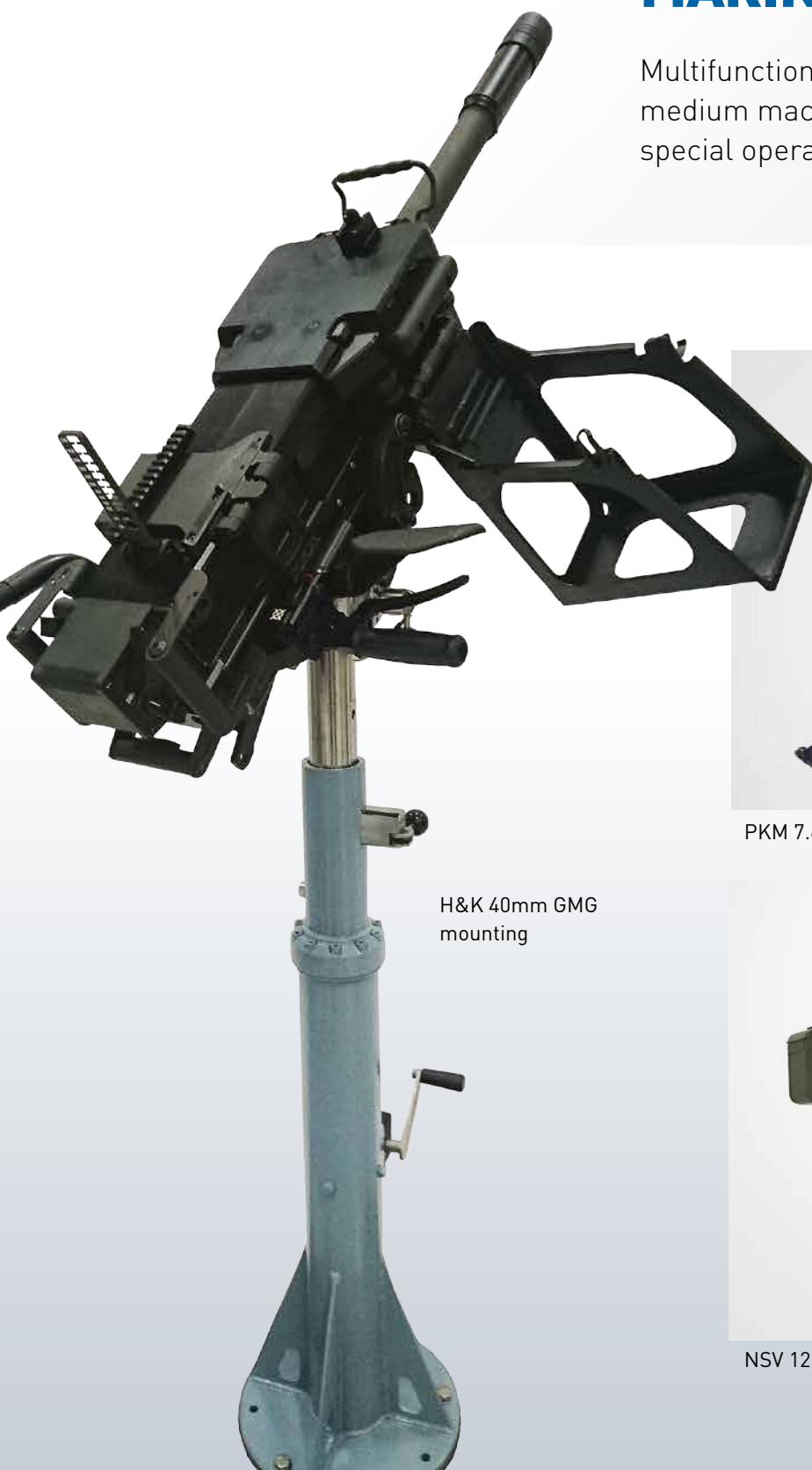
H&K 40mm GMG mounting

Multifunctional pedestal for heavy and medium machine guns for smaller patrol and special operations boats and large vessels.