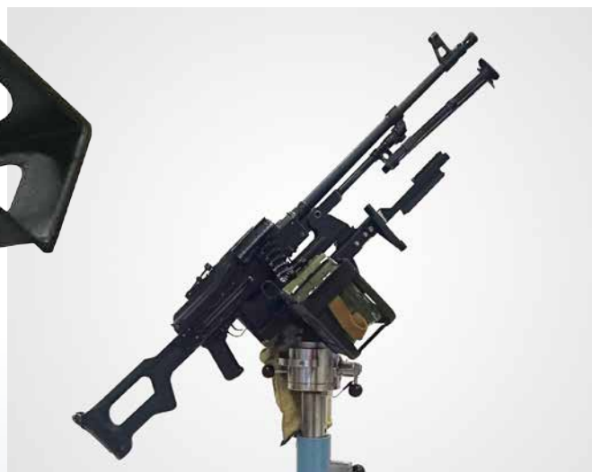
PKM 7.62mm mounting