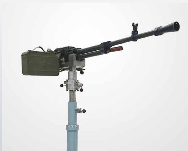
NSV 12.7mm mounting with Combinent cradle